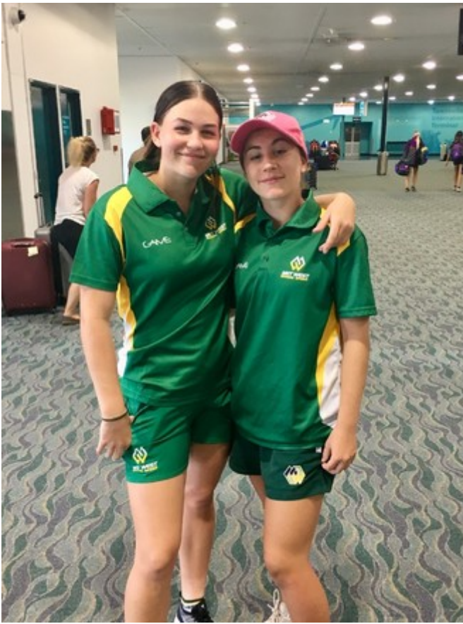
Team photos at the Airport