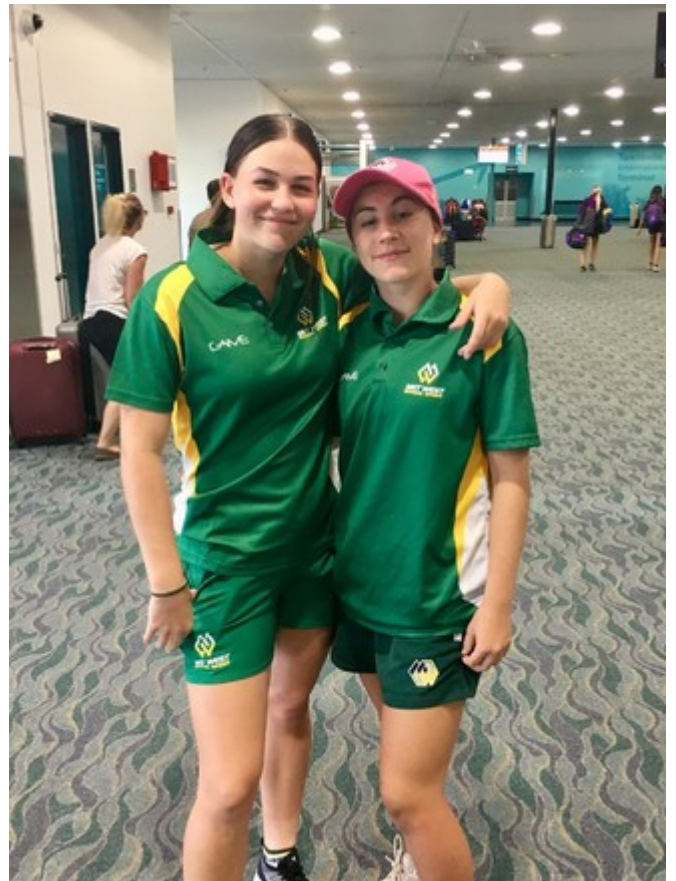
Team photos at the Airport