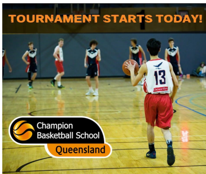
WestMAC made the Facebook feed of Basketball Queensland to announce the Tournament start!

It is a long four day carnival with many hours between the multiple matches played each day. A massive thankyou to the parents and supporters who made the trek out to the Logan City playing venues to cheer on and support both teams at the event.