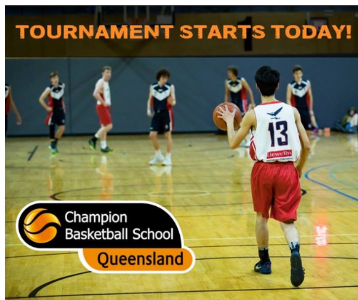
WestMAC made the Facebook feed of Basketball Queensland to announce the Tournament start!

It is a long four day carnival with many hours between the multiple matches played each day. A massive thankyou to the parents and supporters who made the trek out to the Logan City playing venues to cheer on and support both teams at the event.