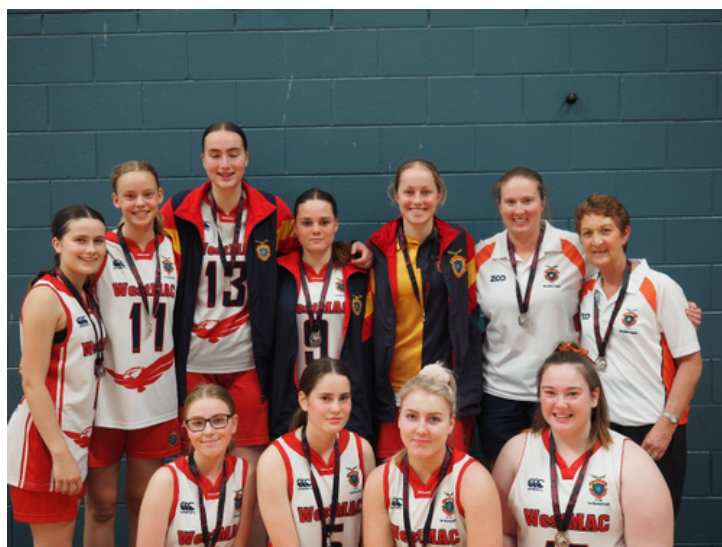
Our WestMAC Girls team after the grand final presentation