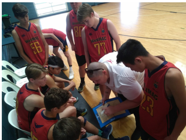
Our Open Boys team listen in on a quarter time huddle.