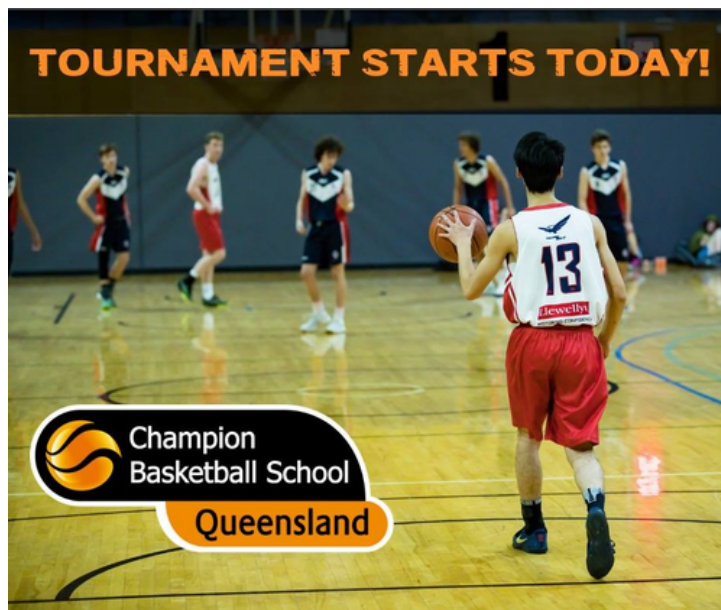
WestMAC made the Facebook feed of Basketball Queensland to announce the Tournament start!

It is a long four day carnival with many hours between the multiple matches played each day. A massive thankyou to the parents and supporters who made the trek out to the Logan City playing venues to cheer on and support both teams at the event.