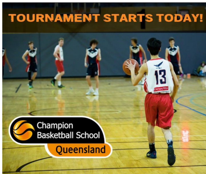
WestMAC made the Facebook feed of Basketball Queensland to announce the Tournament start!

It is a long four day carnival with many hours between the multiple matches played each day. A massive thankyou to the parents and supporters who made the trek out to the Logan City playing venues to cheer on and support both teams at the event.